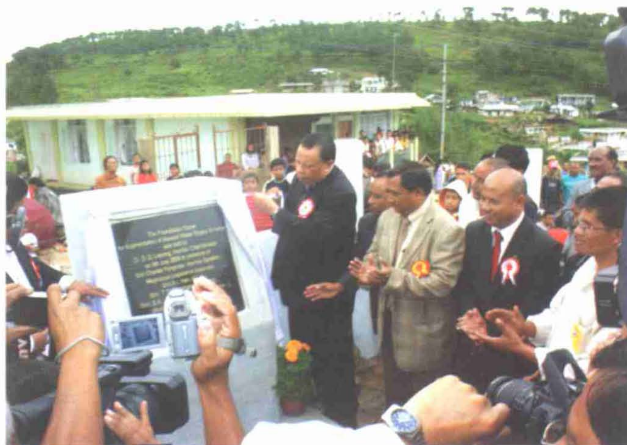
Meghalaya Chief Minister, Dr D D Lapang laying the foundation stone of the Mawpat Water Supply Scheme at MAwpat on July 9, 2009.