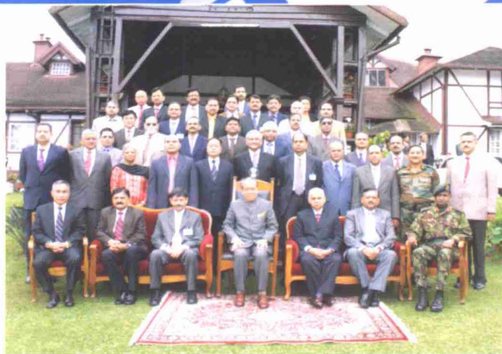
Delegates of the North East DGP's Conference held on October 31, 2009 along with the Governor of Meghalaya at the Raj Bhavan, Shillong.