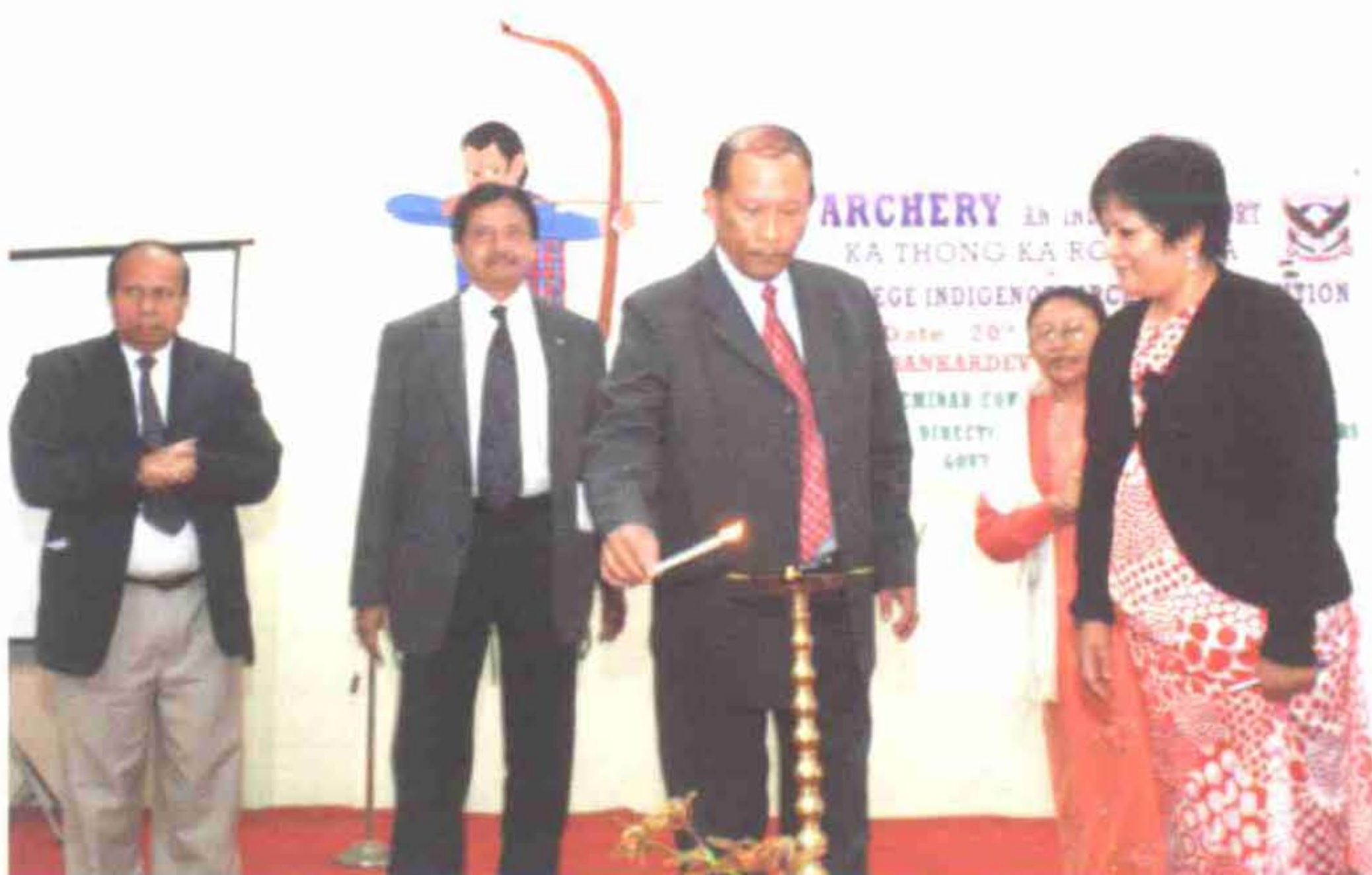
Meghalaya Deputy Chief Minister, Mr. Bindo Lanong lighting the lamp to mark the inauguration of the seminar on Archery held on October 20, 09 at Sankardev College.