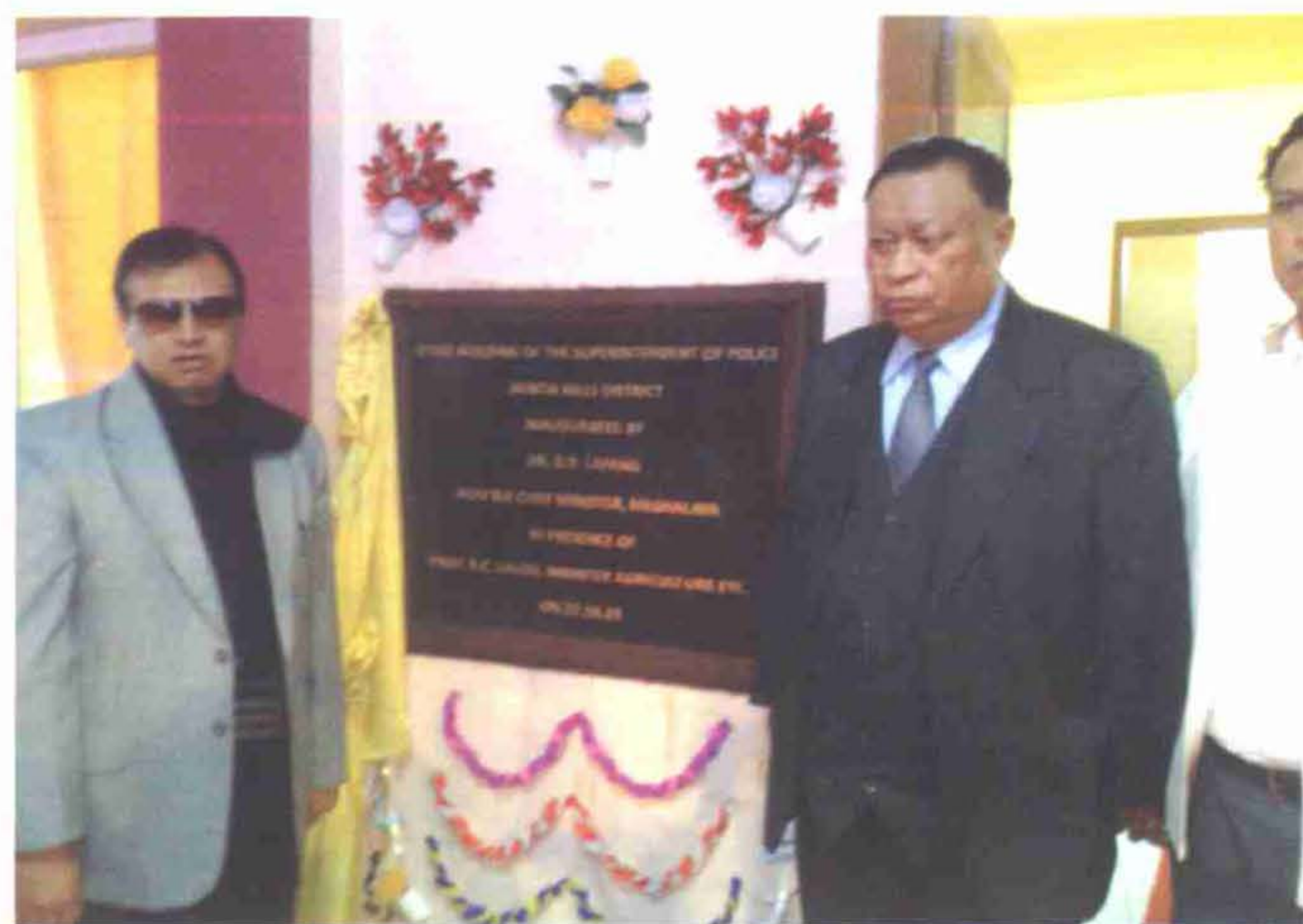
Meghalaya CM Dr. D D Lapang while inaugurating the newly constructed SP office building at Jowai on August 22, 2009