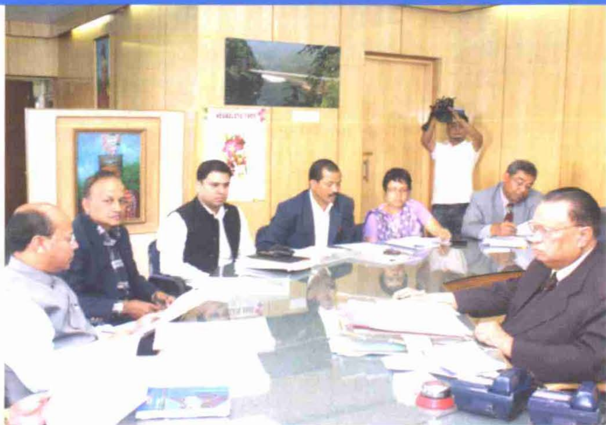
Meghalaya Education Task Force in its meeting held at the Chief Minister's chamber on October 14, 2009.