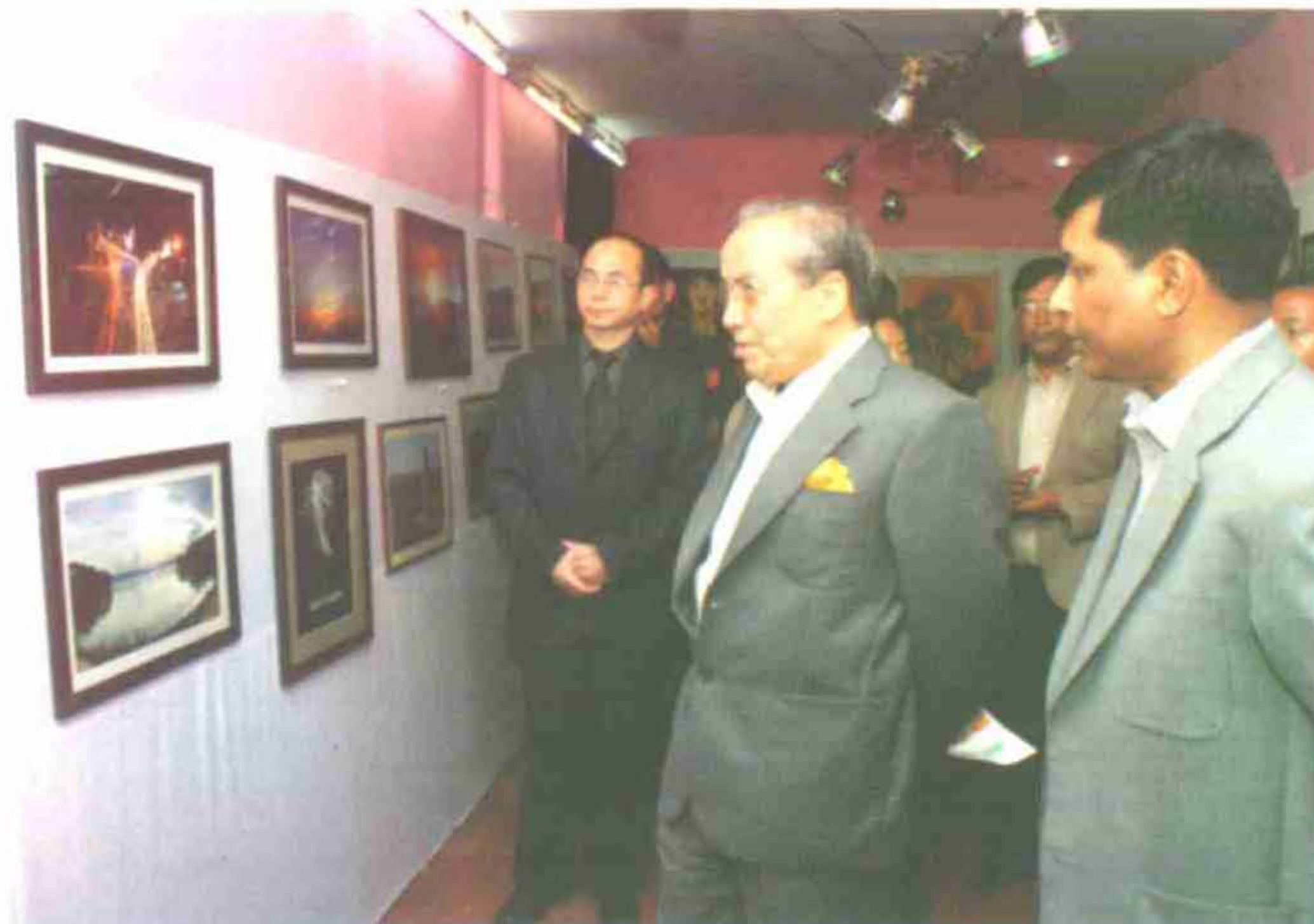
The Governor of Meghalaya doing the round at the North East Cultural Festival held at the State Central Library, Shillong on October 14, 2009.