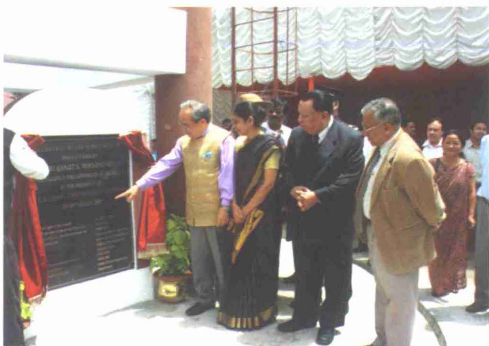
The Governor of Meghalaya, Mr. R. S. Mooshahary inaugurating the Raj Bhavan Water Supply Scheme on August 25, 2009 at the premises of the Raj Bhavan, Shillong.