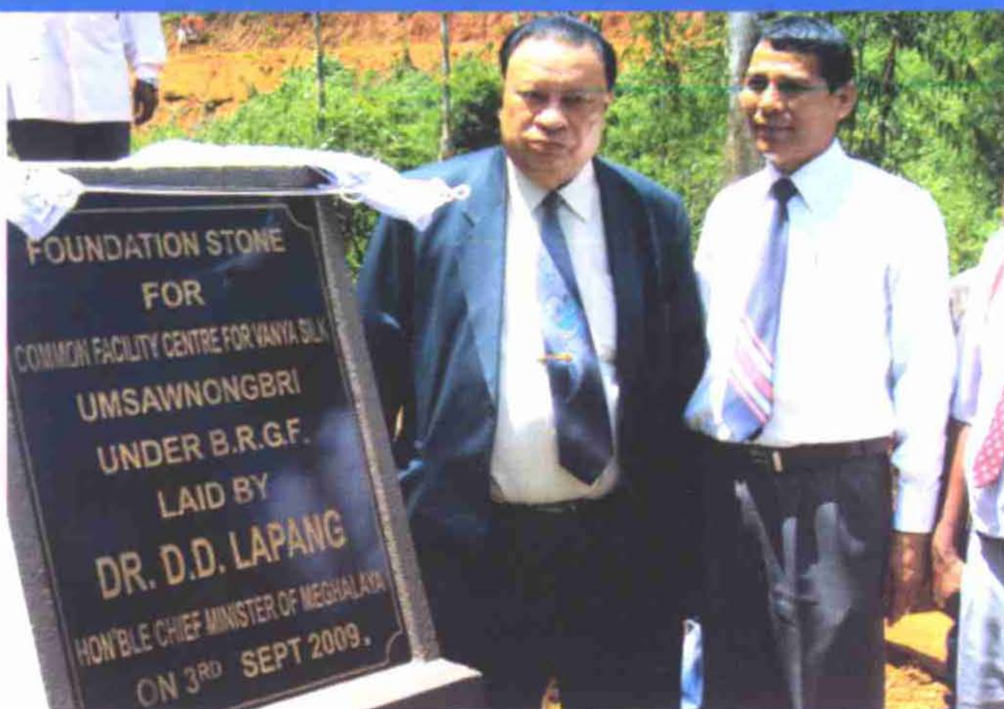
Meghalaya Chief Minister, Dr D D Lapang laying the foundation stone of the Common Facility Centre for Vanya Silk at Umsawnongbri, Ri Bhoi District on September 3, 2009