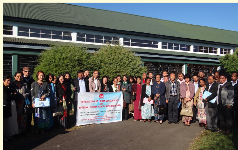
Participants during the one day Orientation programme of Urban Local Bodies on National Urban Health Mission (NUHM) held at Pasteur Institute, Lawmali, Shillong on 05-12-2017.