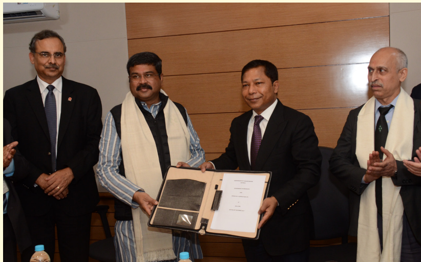
Union Minister for Petroleum and Natural Gas, Shri. Dharmendra Pradhan called on Chief Minister, Dr. Mukul Sangma at the latter's residence on 09-12-2017 during the Union Minister's visit to Shillong. A Memorandum of Understanding was also signed between the Government of Meghalaya and Indian Oil Corporation Ltd on the occasion.